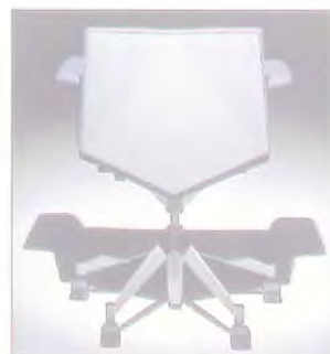
TECHNICAL: 100% Design (p42).