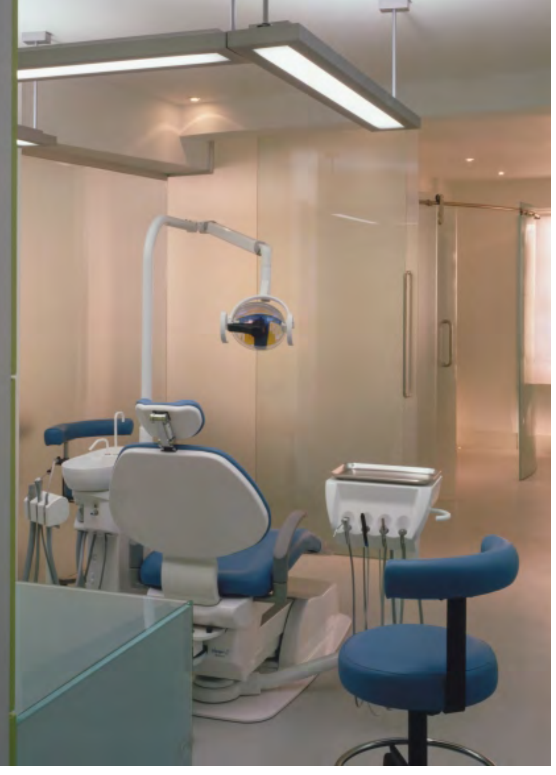
Figure 2: A view of one of the surgeries. The entire practice is paperless

in Berkshire for over 20 years and he more or less knew where to plug a gap in orthodontic services. He asked the local Health Authorities of three counties to supply dental lists of GDPs of Slough and the neighbouring area to see the distribution of general practices. He then asked the local educational authorities for statistics on local school