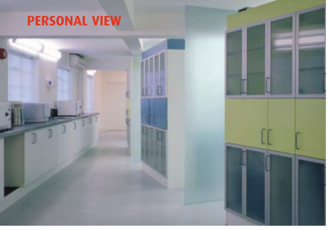
Figures 5 & 6 (above and below): The central sterilising area runs the whole length of the practice, behind each colour-coded surgery